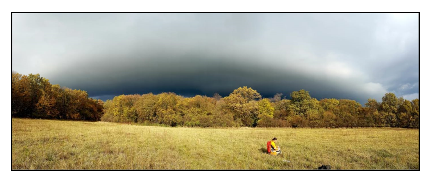
Prospech 2019 ionic leach soil sampling over surface expression of mineralisation at Zemplin assisted by experts from Globex Consulting (former CSIRO).