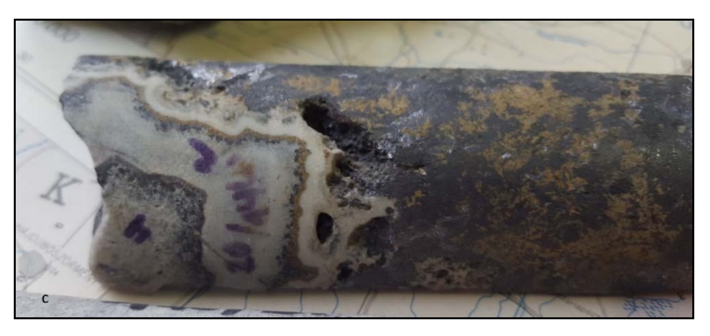
High grade mineralisation from previously drilled Zemplin hole VS-20 (146m) to be tested along strike and down dip.