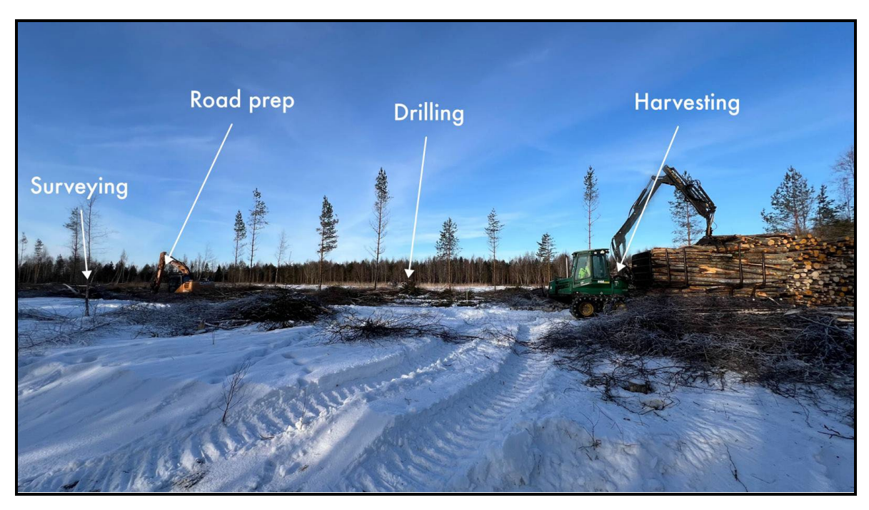
Korsnäs REE program involved use of regrowth tree crops for local community heating purposes.