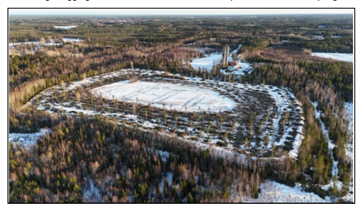
Korsnäs TSF viewed to NE with cleared drill pads now vacated.

Prospech Limited (ASX: PRS, Prospech or the Company ) is pleased to announce the completion of drilling at the historical Korsnäs Mine's Tailings Storage Facility ( TSF ) within the Company's Korsnäs rare earth elements ( REE ) project in Finland.